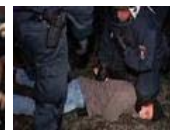
Raw Video: Dozens