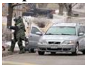
Package Left at